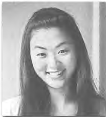
This is Yoko Suzuki. She's a chef.